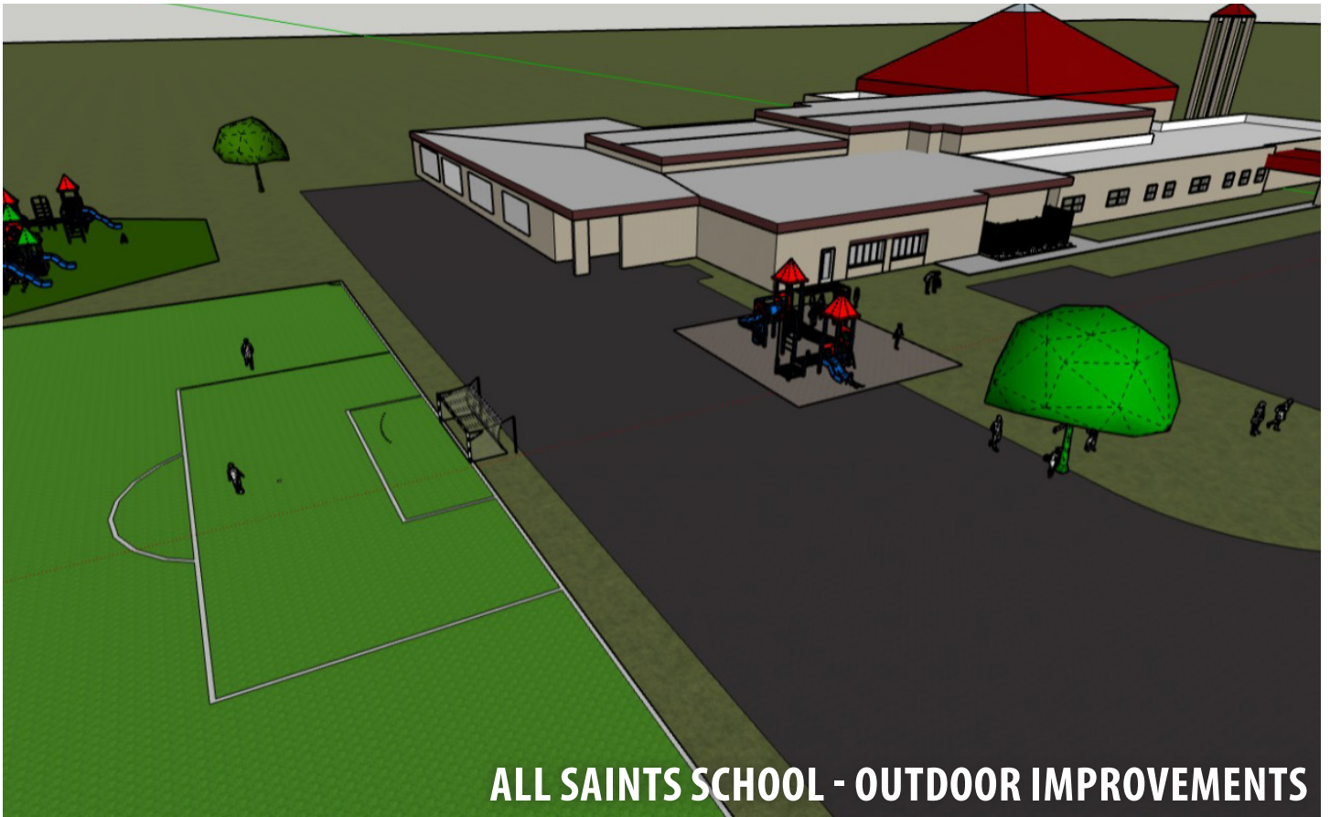
ALL SAINTS SCHOOL - OUTDOOR IMPROVEMENTS