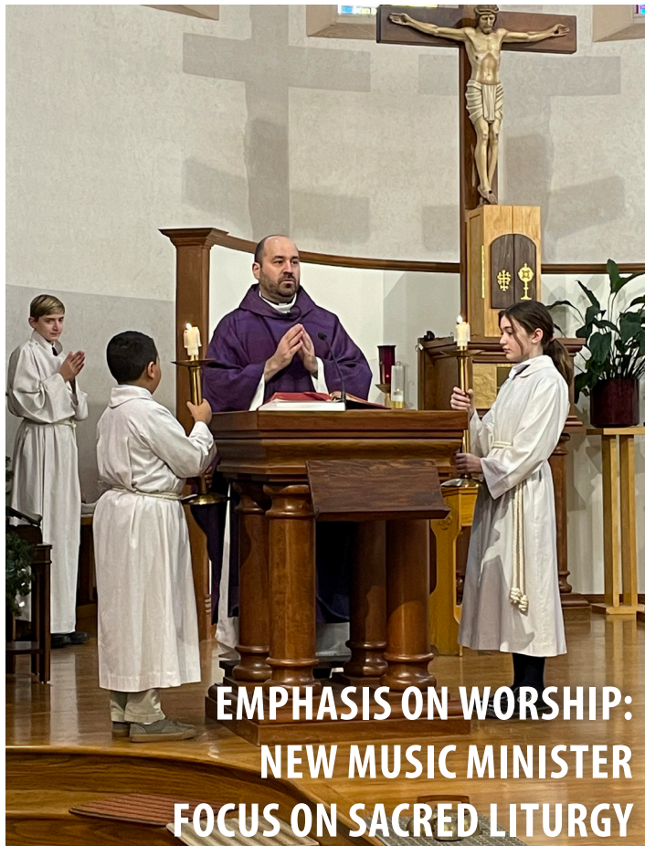
EMPHASIS ON WORSHIP: NEW MUSIC MINISTER FOCUS ON SACRED LITURGY